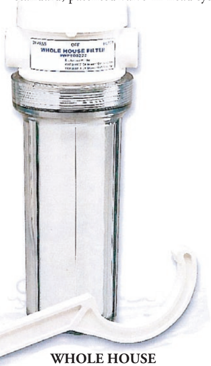
WHOLE HOUSE WATER FILTER

Whole house, light commercial/industrial filters are installed right at the entrance to your house or at the point of entry. These filters are intended to treat all water conditions and come in various flow rates and micron sizes. The Whole House Water Filter has 3/4" mpt reinforced brass inserts. This unique item comes with a standard, patented valve-in-head system with a 50 micron depth sediment filter and wrench.